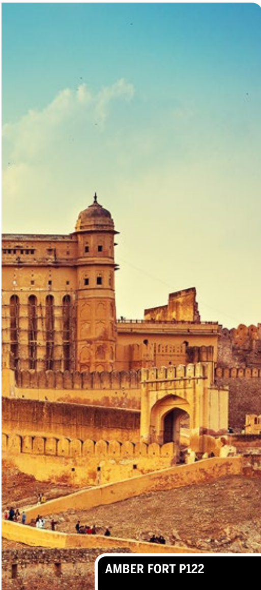
AMBER FORT P122