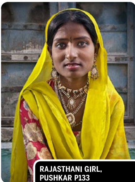
RAJASTHANI GIRL, PUSHKAR P133